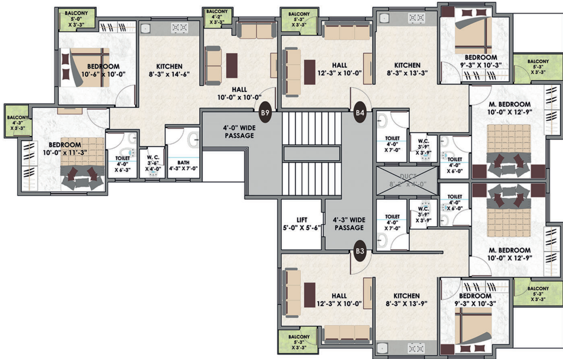
SECOND FLOOR & STILT FIRST FLOOR PLAN