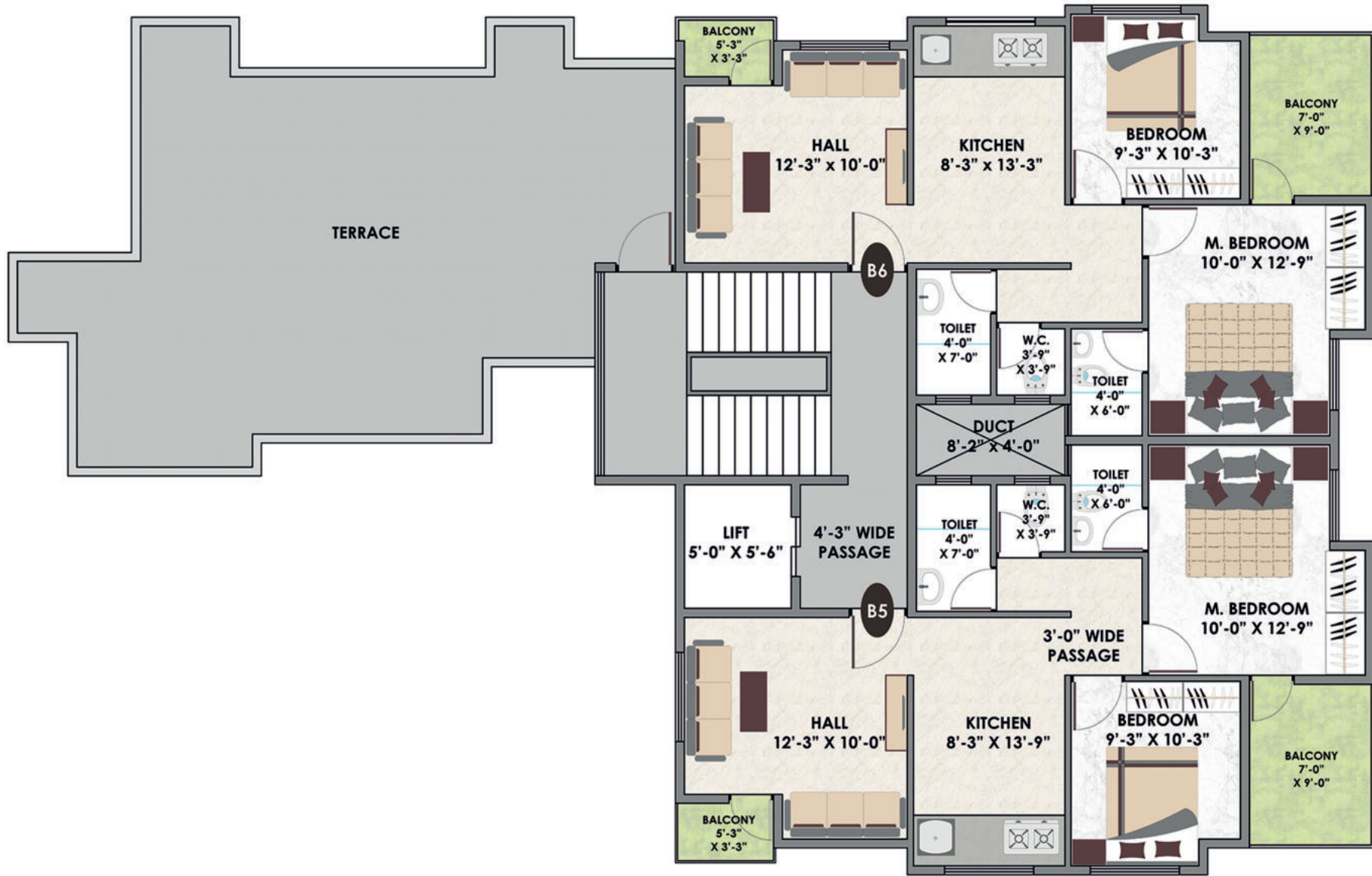
STILT SECOND FLOOR PLAN